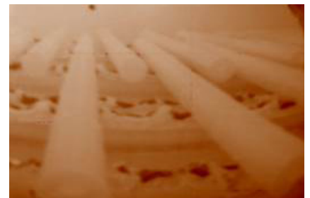
Infrared image of inside furnace