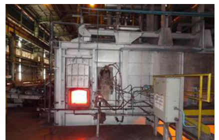
FurnaceSpection system setup